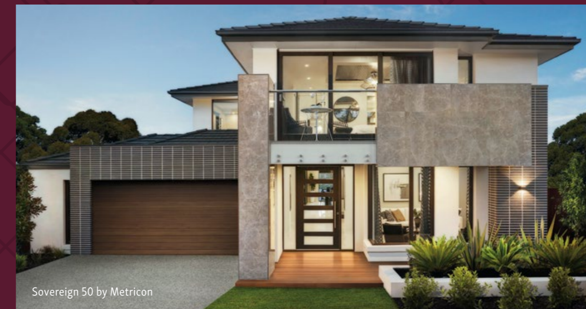
Sovereign 50 by Metricon

The Edge Design Guidelines will guarantee grand homes of impeccable design will surround you, ensuring quality is set to an impressively high standard.