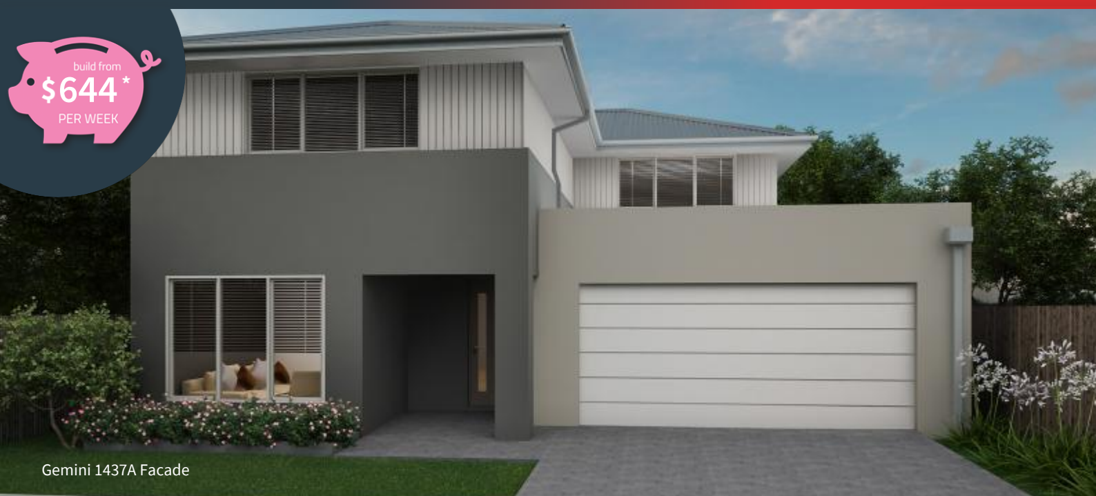
Gemini 1437A Facade

LOT 5744 AMPERSAND BLV , WESTBROOK , TRUGANINA