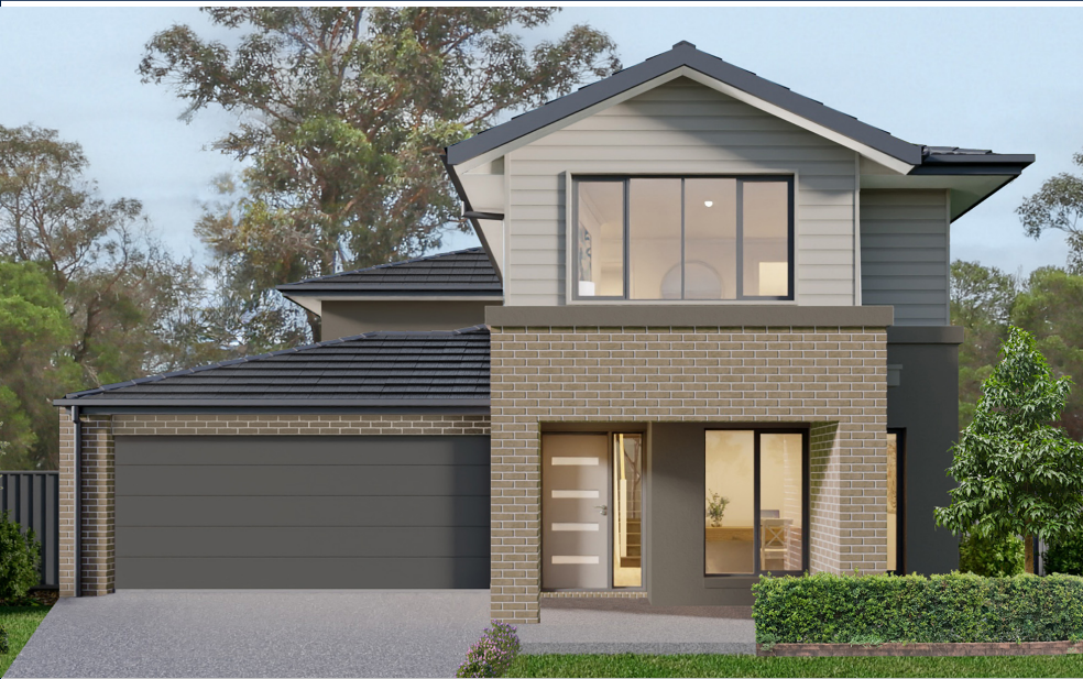
Price excludes upgrade items above standard specification such as feature render and bricks, front entrance timber decking, front entry door, brick infills above garage, external lighting, fencing, concrete paths and driveway. Façade Image may also contain items not supplied by Metricon Homes, namely landscaping and planter boxes.