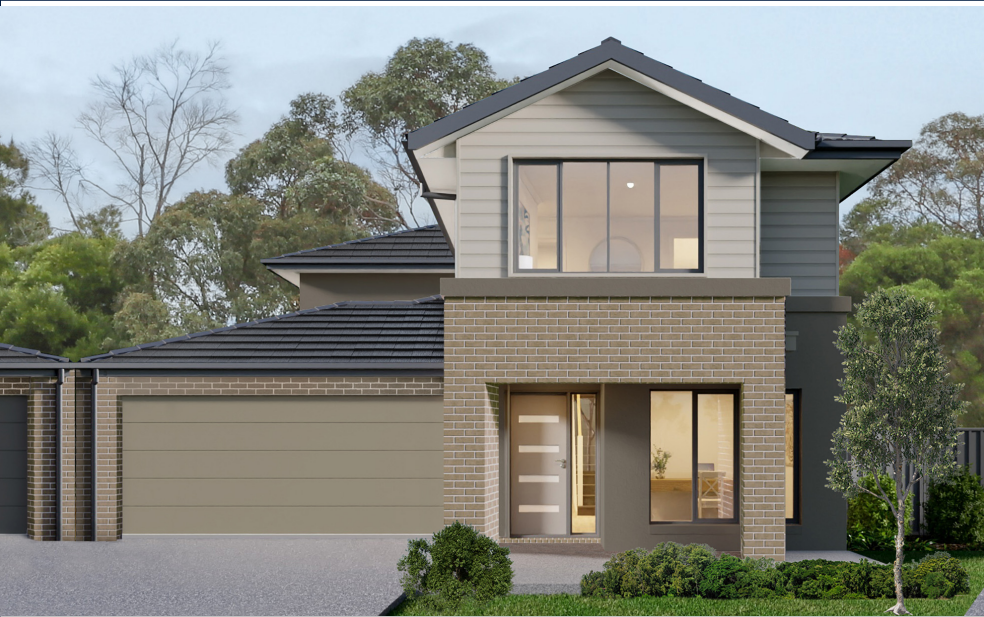
Price excludes upgrade items above standard specification such as feature render and bricks, front entrance timber decking, front entry door, brick infills above garage, external lighting, fencing, concrete paths and driveway. Façade Image may also contain items not supplied by Metricon Homes, namely landscaping and planter boxes.