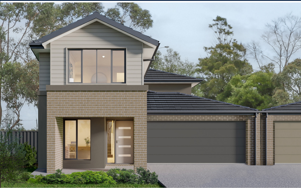
Price excludes upgrade items above standard specification such as feature render and bricks, front entrance timber decking, front entry door, brick infills above garage, external lighting, fencing, concrete paths and driveway. Façade Image may also contain items not supplied by Metricon Homes, namely landscaping and planter boxes.