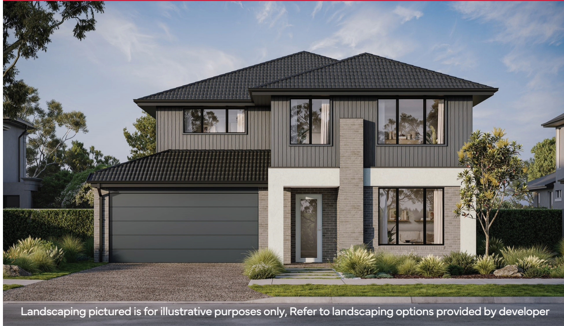
Landscaping pictured is for illustrative purposes only, Refer to landscaping options provided by developer