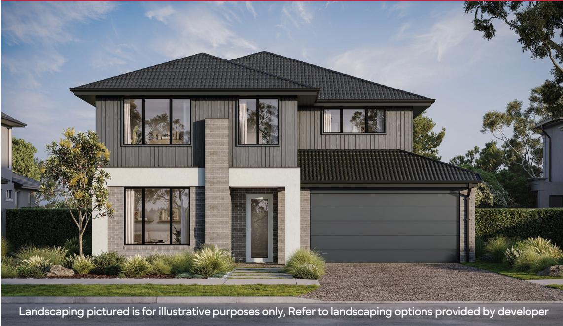
Landscaping pictured is for illustrative purposes only, Refer to landscaping options provided by developer